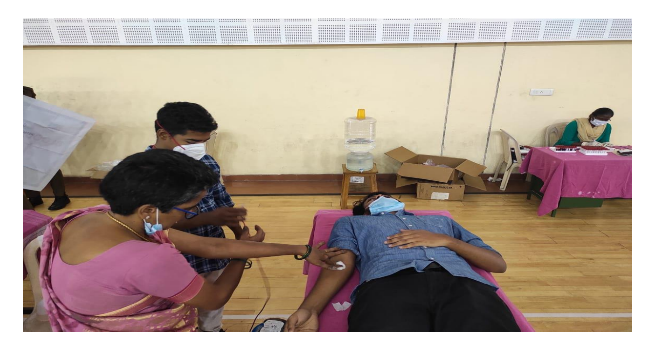
Figure 3. Nurse taking care of the student