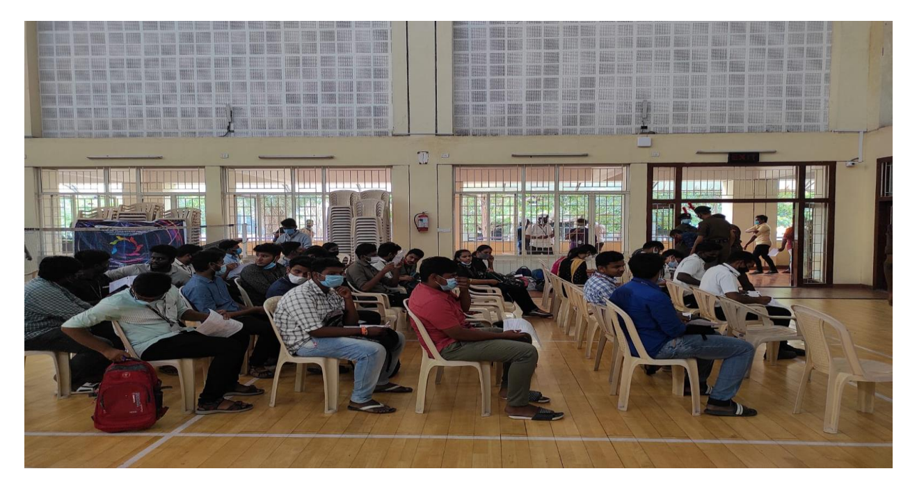
Figure 1. Students of Sri Venkateswara College of Engineering registering for Blood Donation Camp

The blood units were collected by KMC Blood bank , YRC Blood bank , VHS Blood bank and GH Blood Bank . Blood Pressure, Haemoglobin levels and other health conditions of the students were checked by the doctor before donating the blood. Each student donated a unit of blood. The students were given the proper healthcare guidelines and provided with the refreshments after blood donation.