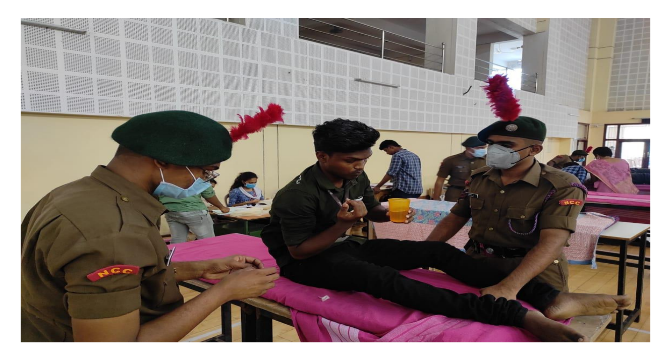
Figure 4. NCC Army Wing cadets providing medical assistance to the students