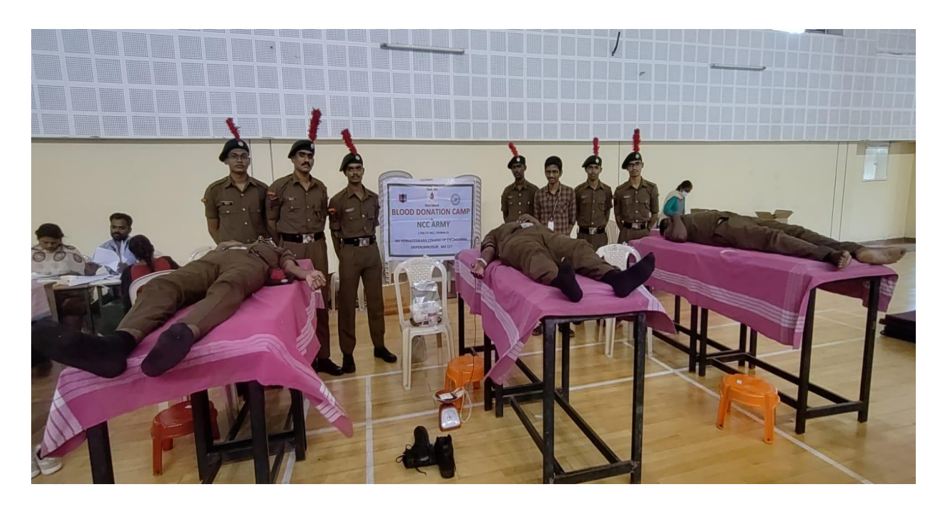
Figure 5. NCC Army Wing cadets donating the blood